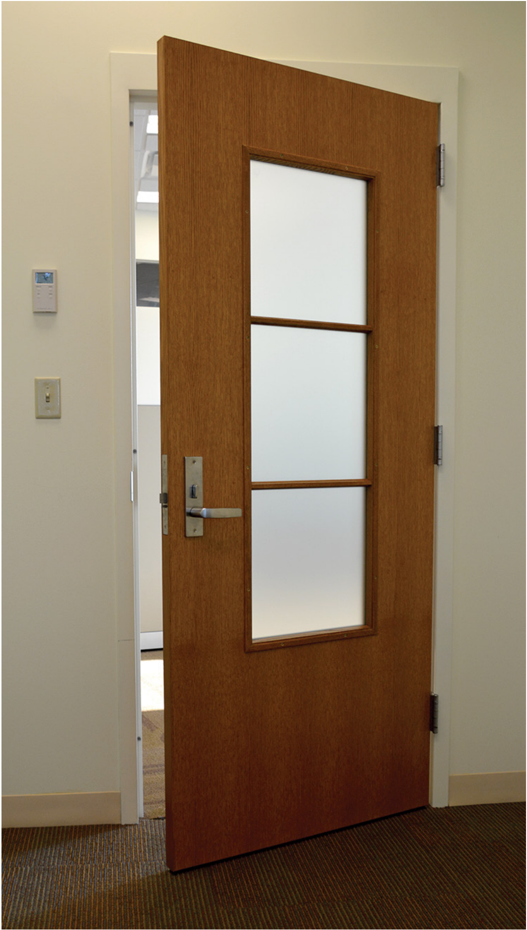
Self-Regulation (Week 3, Days 1) Door Closing